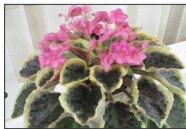
2012 Buckeye Cranberry Sparkler

Mid-Atlantic African Violet Society's 30 th Anniversary Celebration "Violets with Us Throughout the Years"