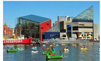
National Aquarium in Baltimore

On Saturday, November 12 th , we'll be having a tour of the National Aquarium in Baltimore. The National Aquarium houses several exhibits including the Upland Tropical Rain Forest, a multiple-story Atlantic Coral Reef, an open ocean shark tank, and Australia: Wild Extremes, which won the "Best Exhibit" award from the Association of Zoos and