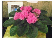
2007 Gentle May