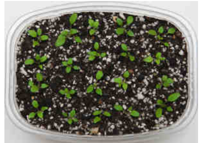
Sprouts and spiked young plants