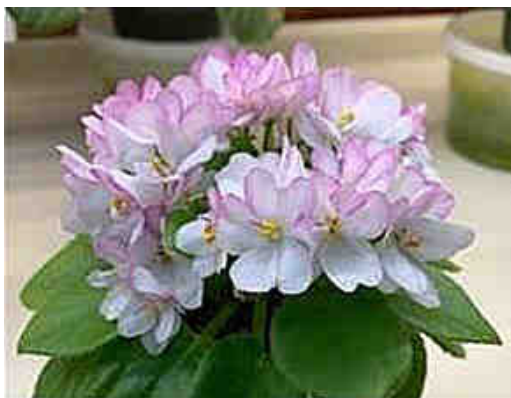
SK-Afrodita (SK-Aphrodite) Semiminiature