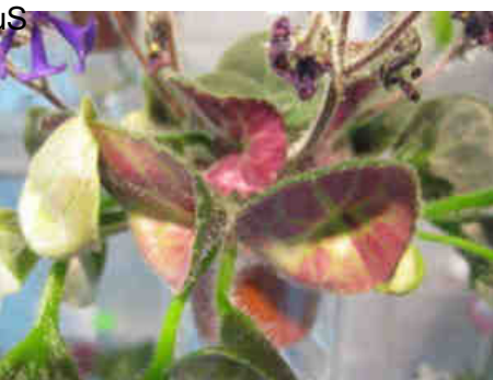
SK-Lunatic with wasp foliage

What most growers find so intriguing about Russian and Ukrainian hybrids are their hybridizers' methods of achieving their unique trait of