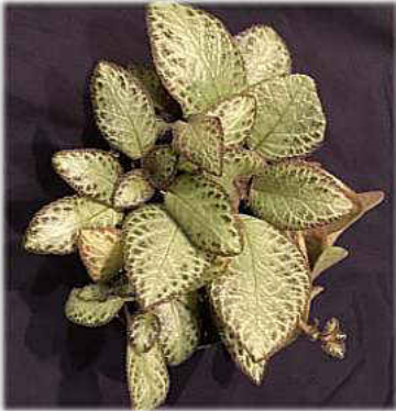
Episcia Silver Sheen Shown by Donna Biggs