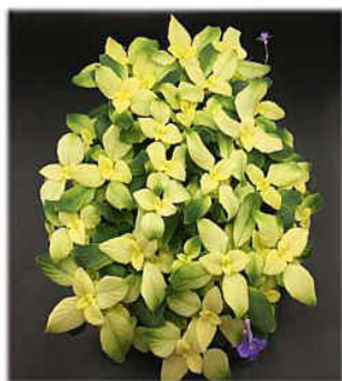
Streptocarpella Blueberry Cream