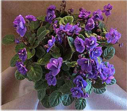
Tiny Moon Goddess Shown by Karyn Cichocki