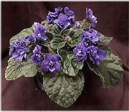
Blue Girl Shown by Sue Hoffmann