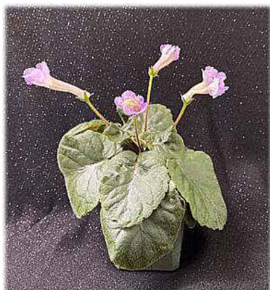
Ozark Leprechaun Magic Shown by