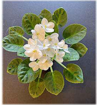
Optimara Ontario Shown by Erika Geimonen