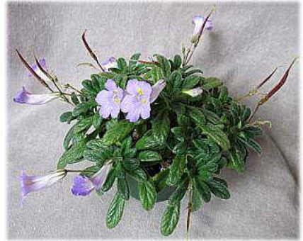
Primulina linearicalyx Shown by Karyn Cichocki