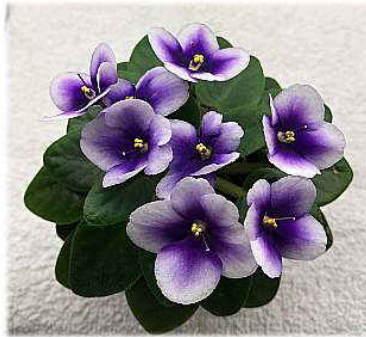
Optimara Little Intermezzo Shown by Linda Stinnette