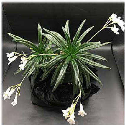
Primulina (opipogoides x linearifolia)