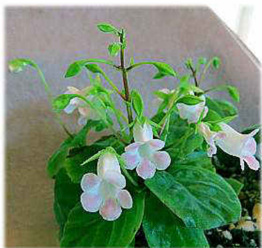
Sphaerorrhiza rosulata Shown by Karyn Cichocki