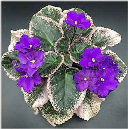
Black Magic Shown by Minh Bui