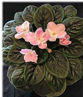
Optimara Noid Shown by Donna Biggs