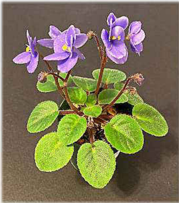
Windsome Shown by Erika Geimonen