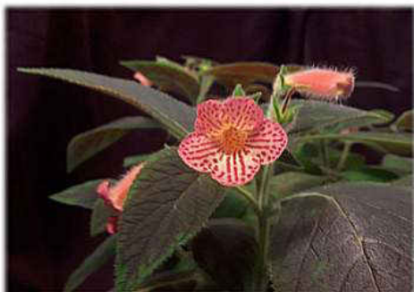
Kohleria - Peridot's Mango Martini