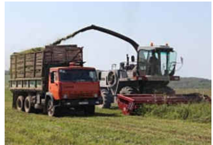
OK Milk Farm Operation (from Seed to Cheese!)