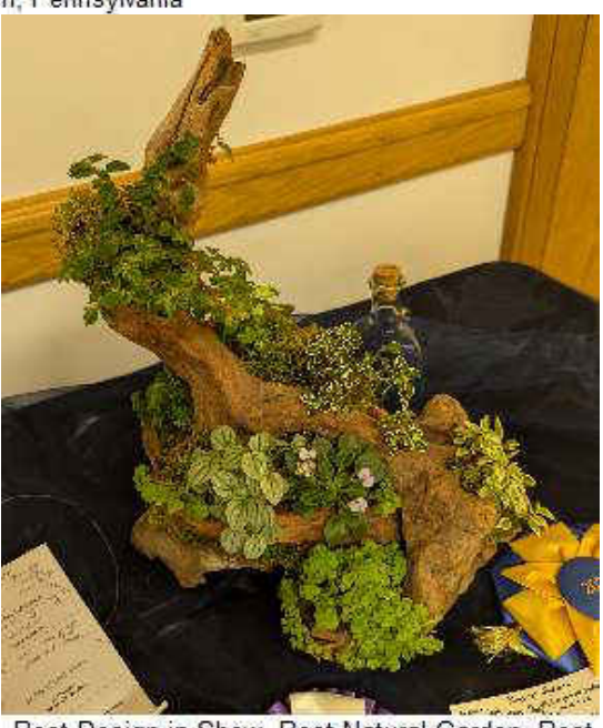
Best Design in Show, Best Natural Garden, Best Container Garden, & Tri-Color "Natural Garden" Won by: Jill Fischer from Farmville, Virginia